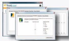
Teacher Edition (Capture) 815-5082-103